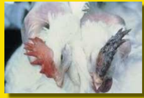
Purple discoloration of the comb.

AI is a viral disease of poultry. AI can be of low pathogenicity (LPAI), causing mild disease with or without clinical signs, or of high pathogenicity (HPAI), causing severe disease and death loss. Wild birds, especially migratory waterfowl (ducks and geese) are carriers of the virus and can pass the disease along even though they appear healthy.