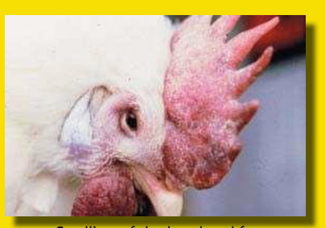
Swelling of the head and face.